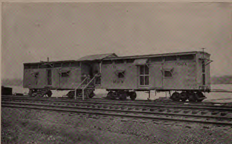
"Zoners" forced to live in box-cars are furnished all the comforts of home